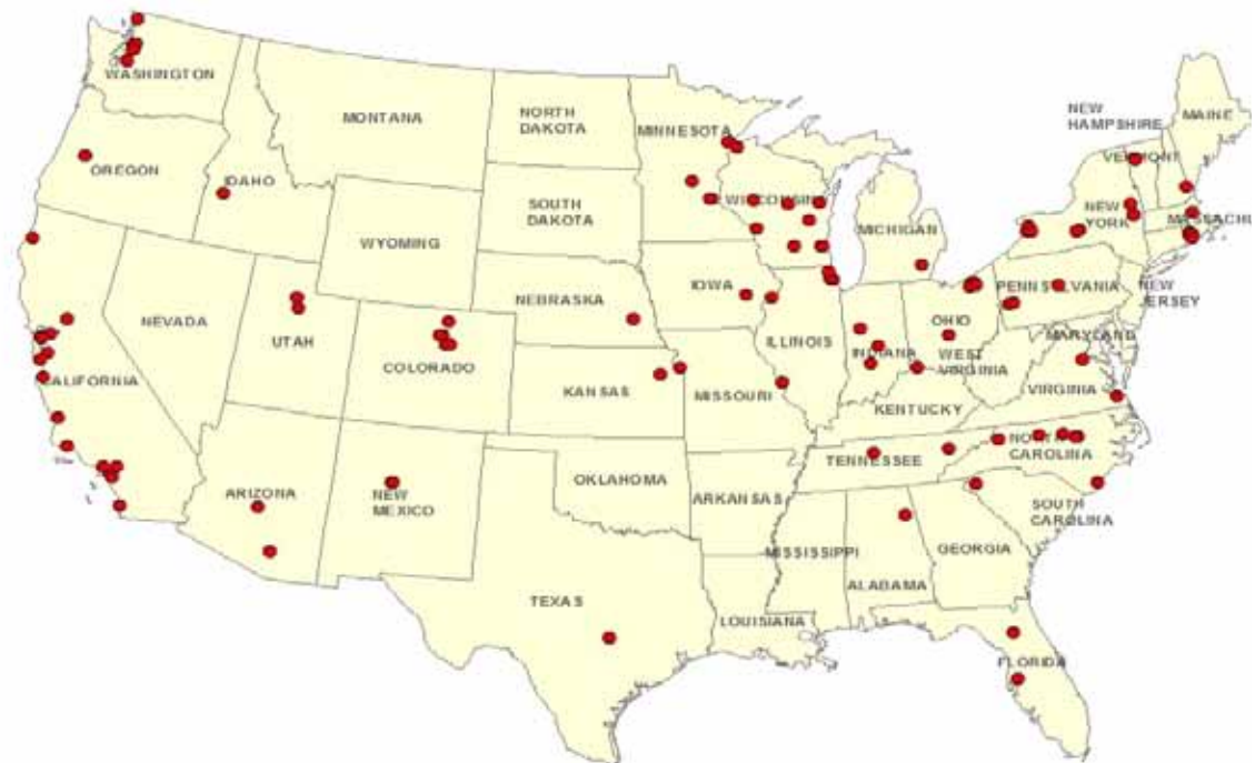
Figure 1. Colleges and Universities with U-Pass, Transit Discount or Fare-Free Transit Programs in the Conterminous United States 21

Other colleges and universities augment local transit service by providing private, university-run shuttle buses. A