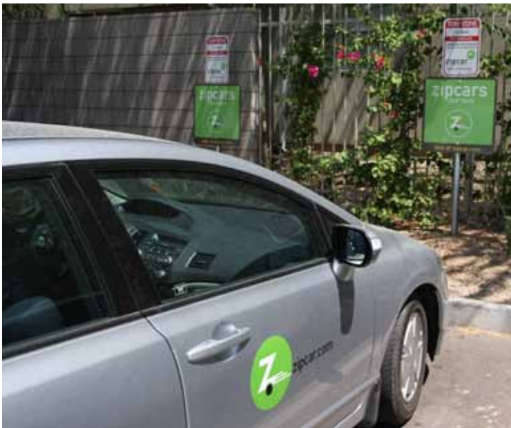
Shared vehicles, like this Zipcar parked at Arizona State University's campus in Tempe, Arizona, are available for students and staff to rent at hundreds of colleges and universities in the United States.

The Massachusetts Institute of Technology (MIT) is one campus that has