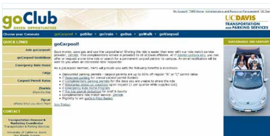
UC-Davis promotes its carpool program online.